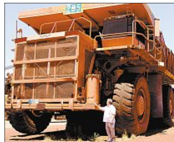
Trucks like these could be filled with bauxite ore from around the region to bring millions, if not billions, of dollars to the region.